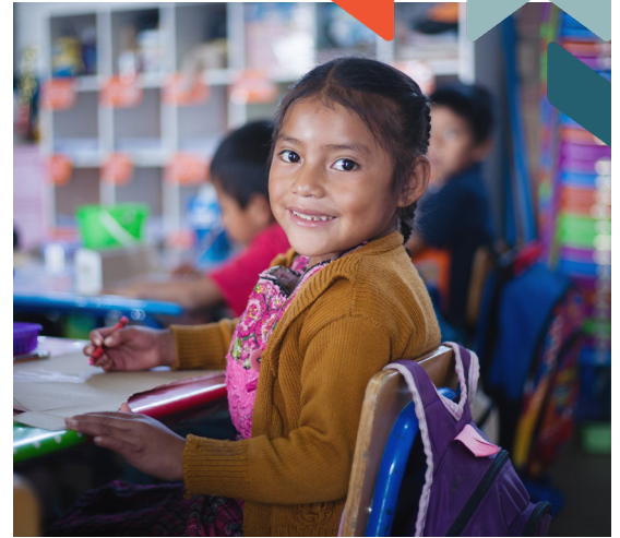
Access to quality education means girls like this one have a greater opportunity for success in school and beyond.

Child Aid breaks that cycle. We empower educators by committing to a four-year teacher training program that stresses critical thinking skills and developing a community of reading. Our organization bolsters teachers’ skills by conducting hands-on workshops, one-on-one coaching sessions and creating more engaging and interactive classrooms. We support all this learning by providing a robust library of books and teaching materials for each of our schools.