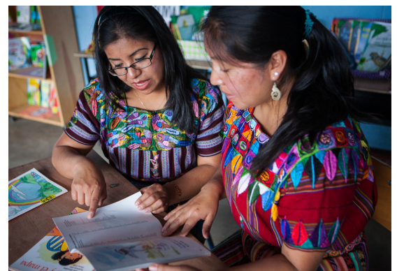
Child Aid Literacy Trainers work one-on-one with teachers in their classrooms, helping them become skilled and effective educators.